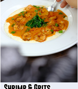
Our twist on a southern classic.