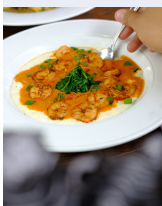
SHRIMP & GRITS