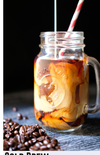
Highly caffienated. Now in three new flavors.

All new vegan-friendly breakfast featuring plant-based JUST Egg® scramble.