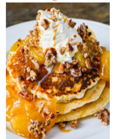
SPICED APPLE PANCAKES

WEEKDAYS (TAMPA LOCATION ONLY) 7 AM - 11 AM