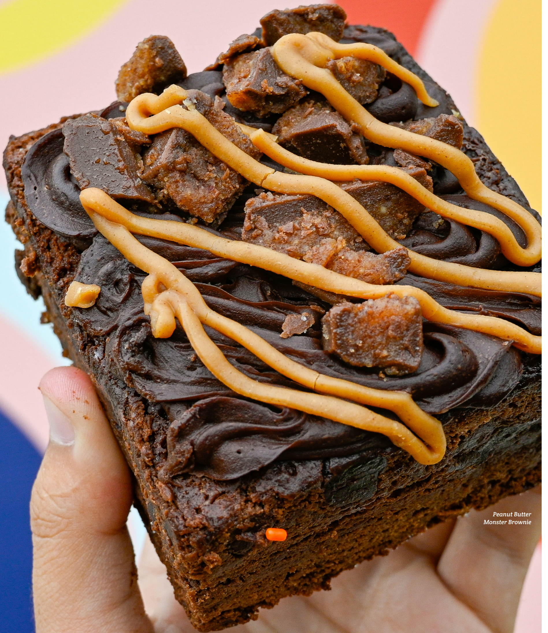
Peanut Butter Monster Brownie

doughnuts • cupcakes • lattes • milkshakes • cakes • brownies • and more!