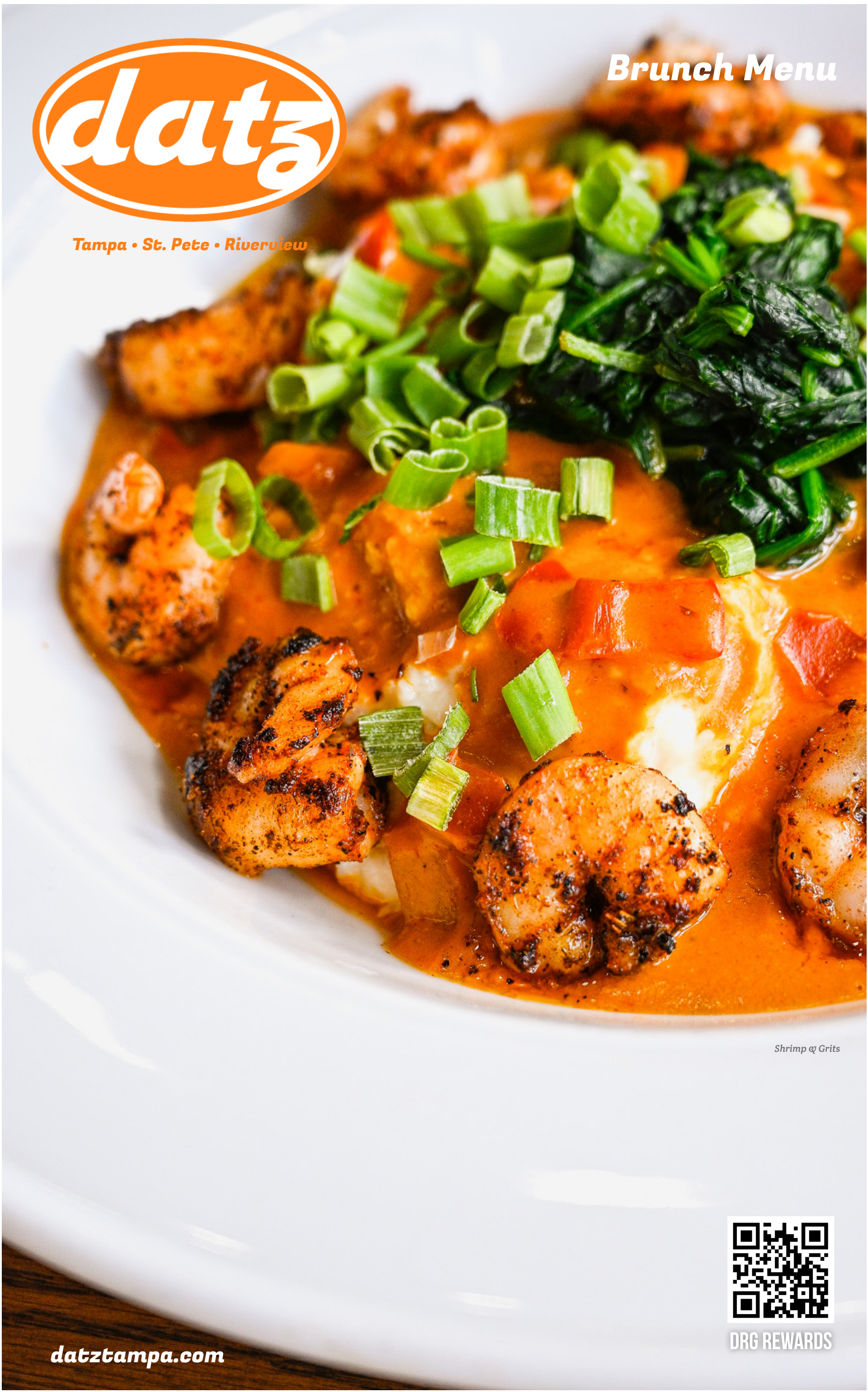
Shrimp & Grits