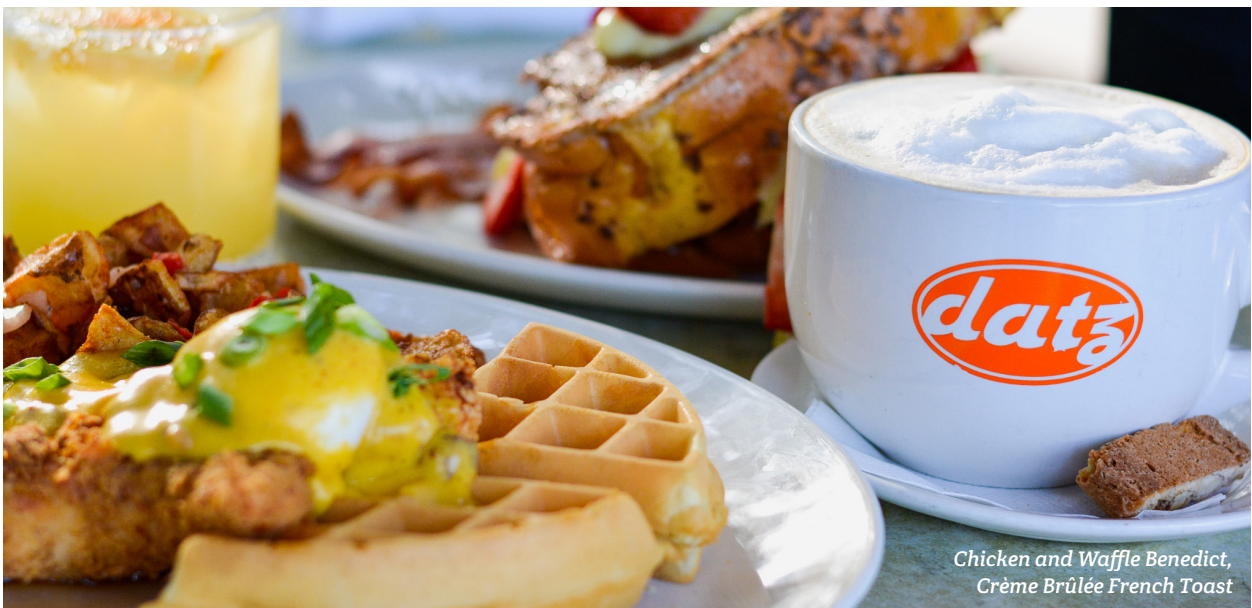
Chicken and Waffle Benedict, Crème Brûlée French Toast

Handhelds Handhelds are served with your choice of house-cut Idaho breakfast potatoes, cream cheese cheddar grits or fruit salad.