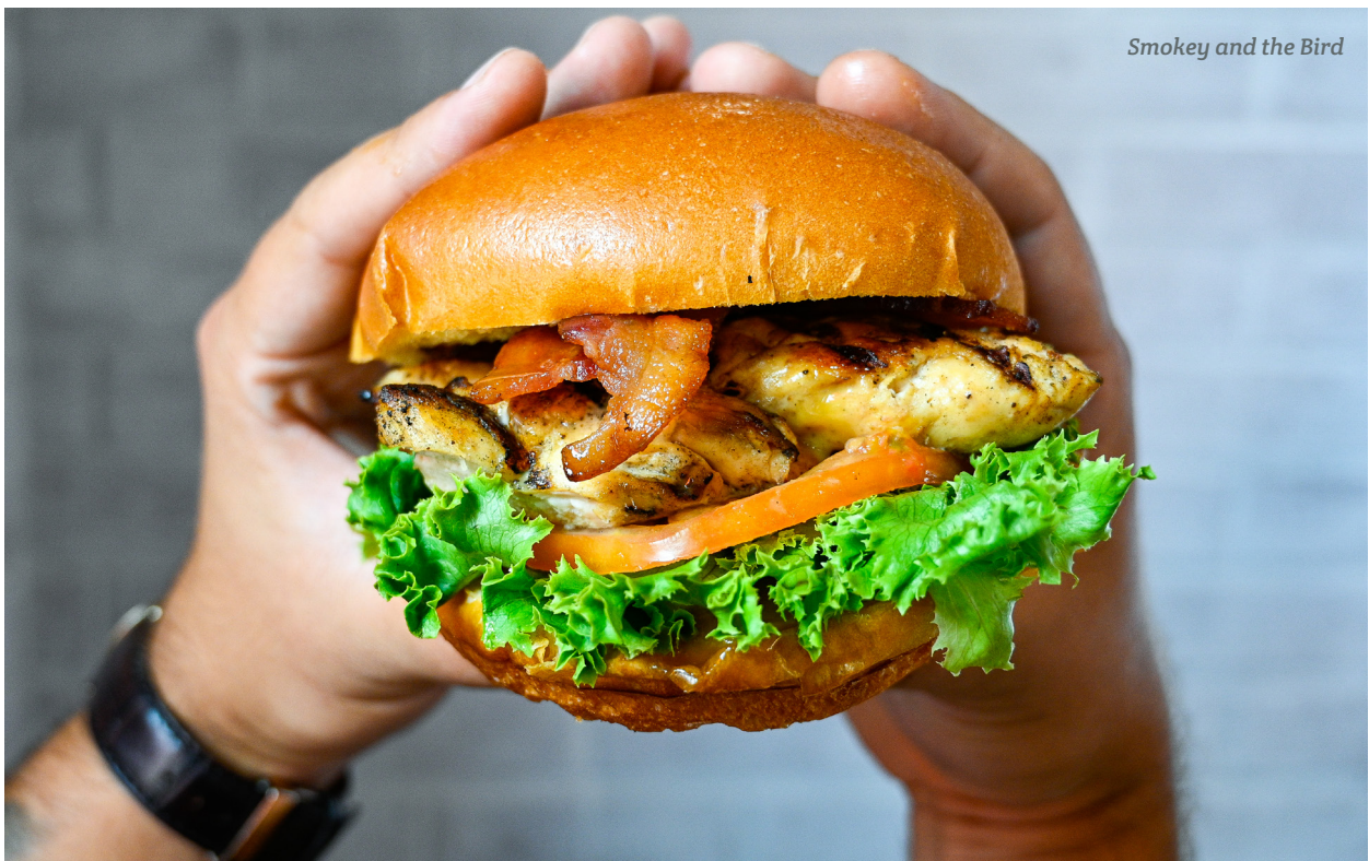
Smokey and the Bird

11AM - 10PM • MON-THURS // 11AM - 11PM • FRI // 3PM - 11PM • SAT & SUN