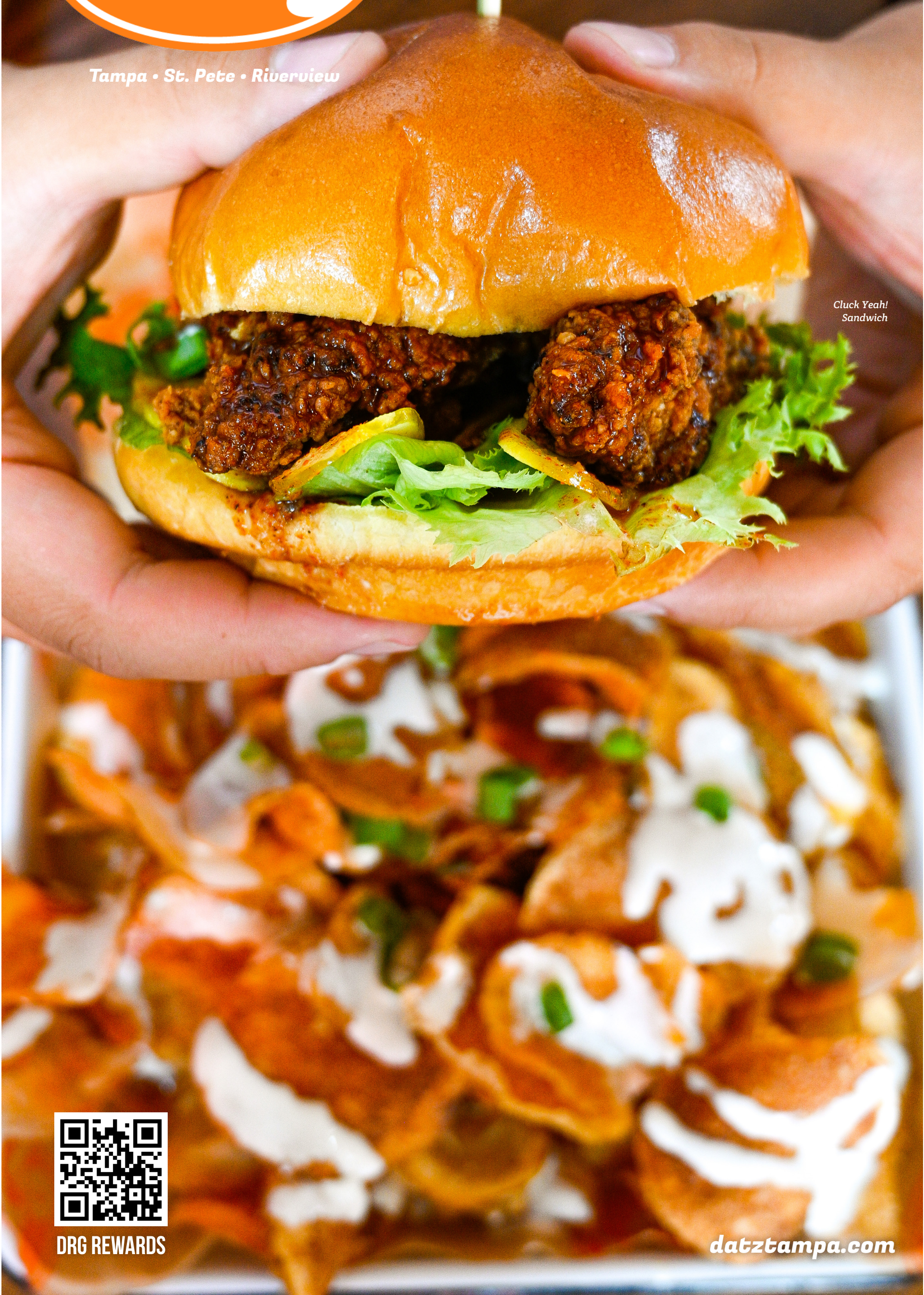
Cluck Yeah! Sandwich