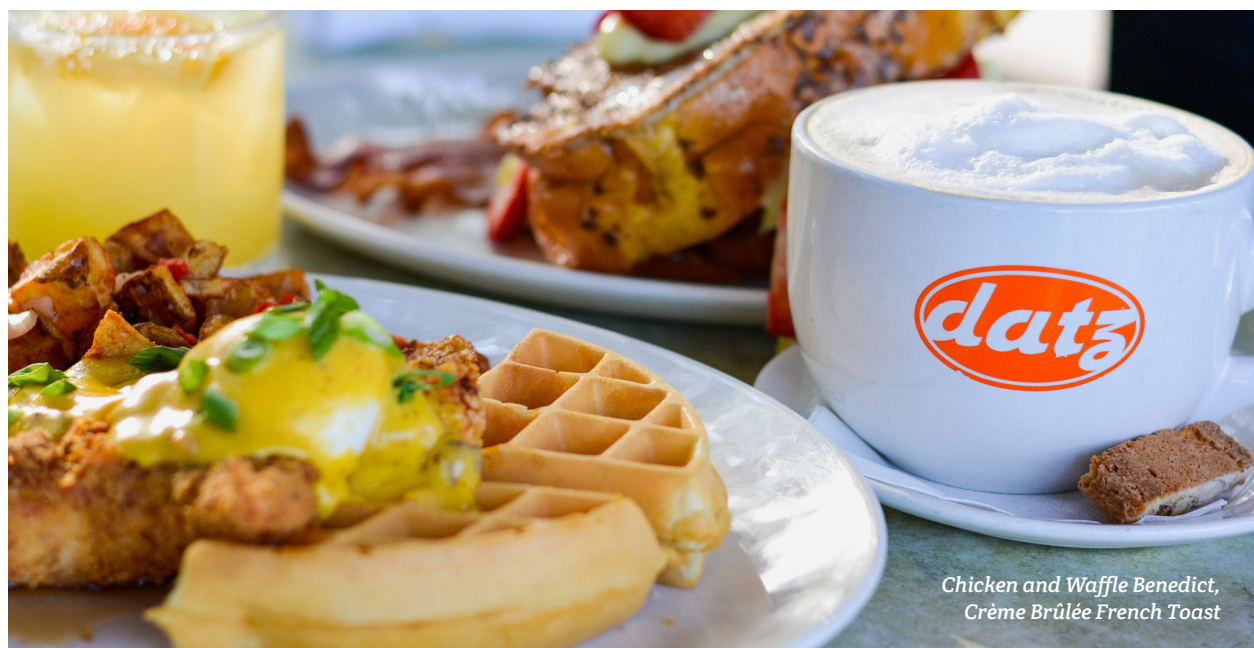
Chicken and Waffle Benedict, Crème Brûlée French Toast

7AM - 11AM • WEEKDAYS (TAMPA LOCATION ONLY)