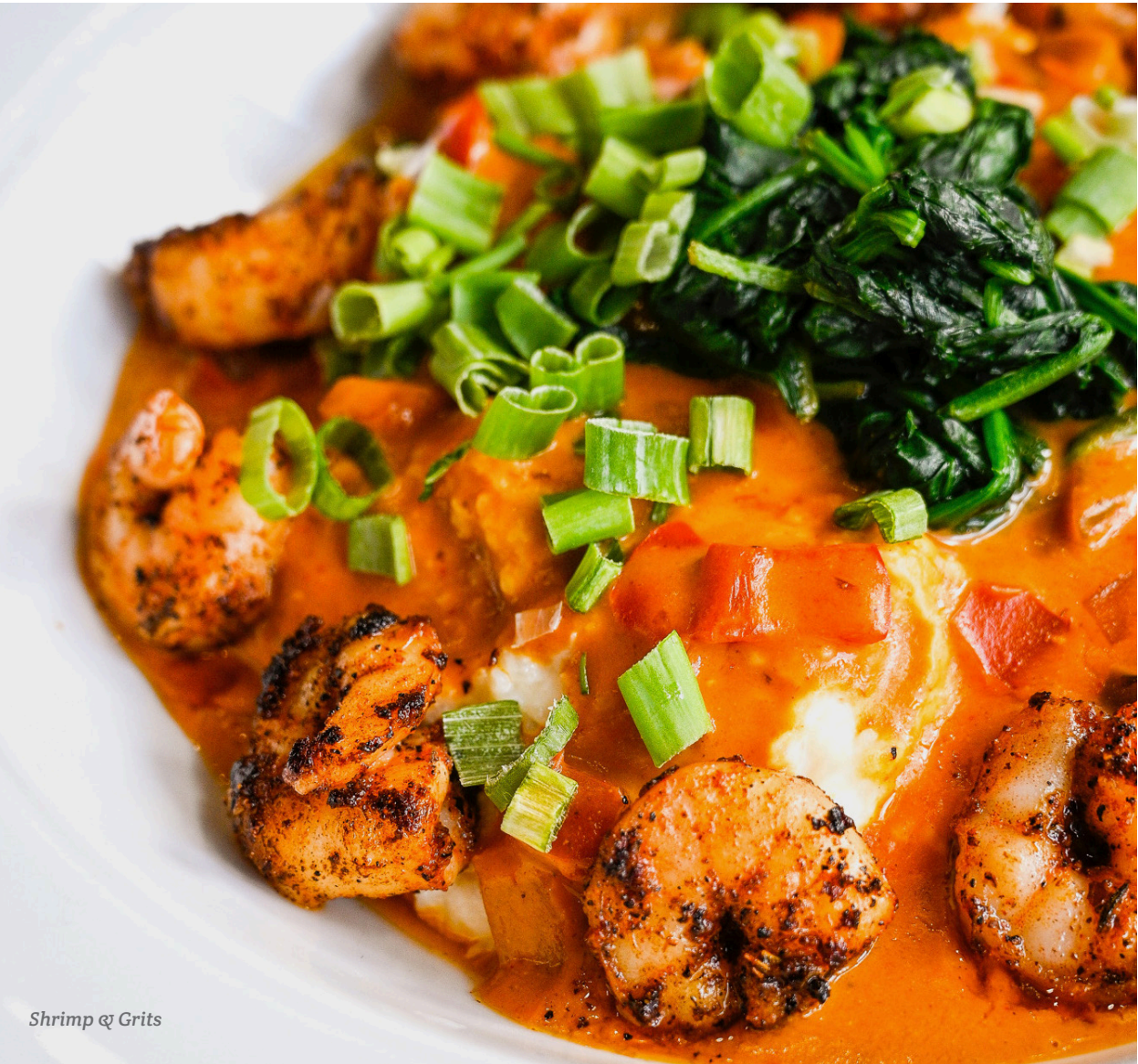
Shrimp & Grits

Chopped lettuce with onion, cucumber, tomato, banana peppers, crumbled feta, and a Greek olive blend. Served with potato salad and Greek dressing. 14