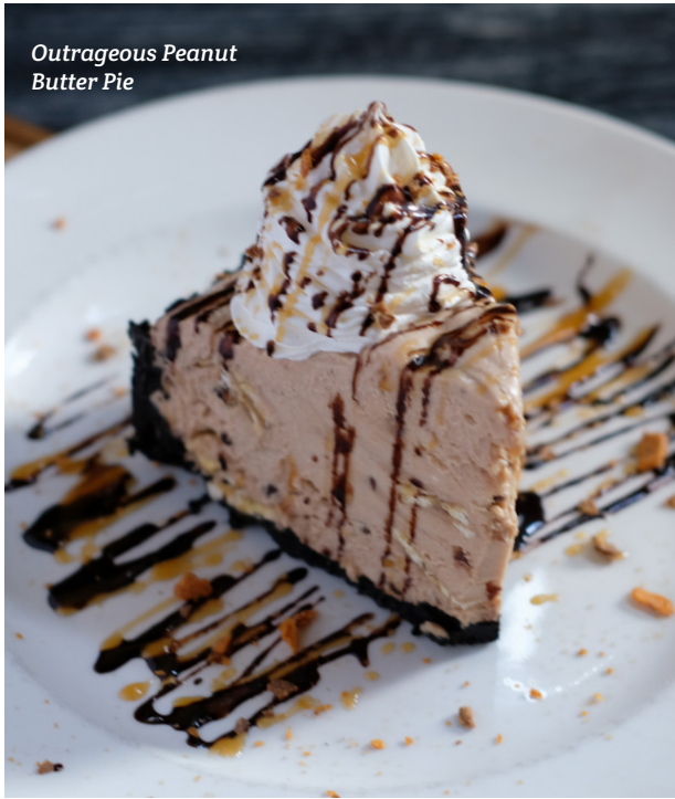
Outrageous Peanut Butter Pie