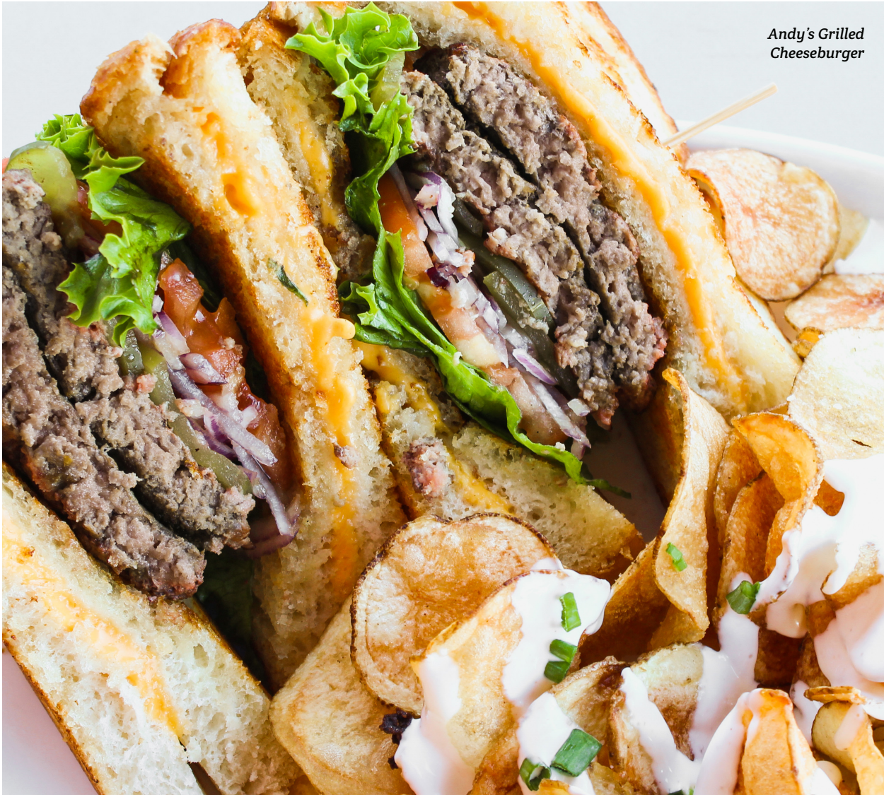
Andy's Grilled Cheeseburger

Add shrimp, salmon*, chicken or steak*. Add 8