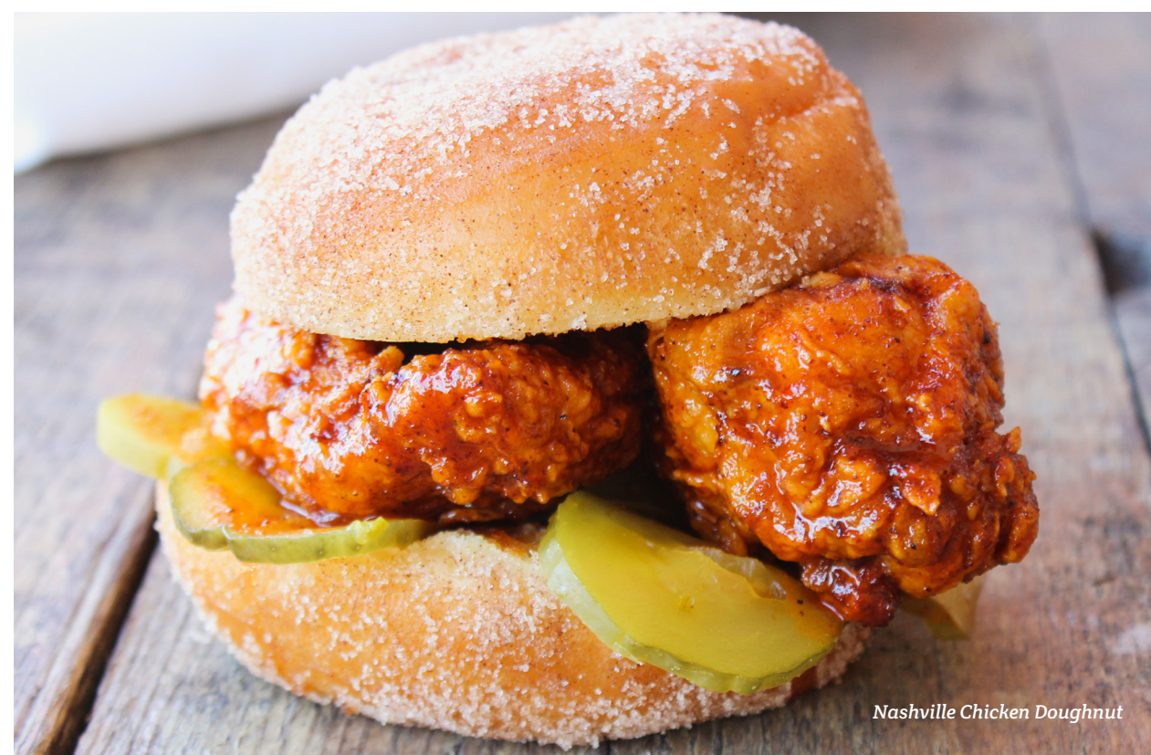
Nashville Chicken Doughnut

8:30AM - 3PM • SAT || 8:30AM - 9PM • SUN