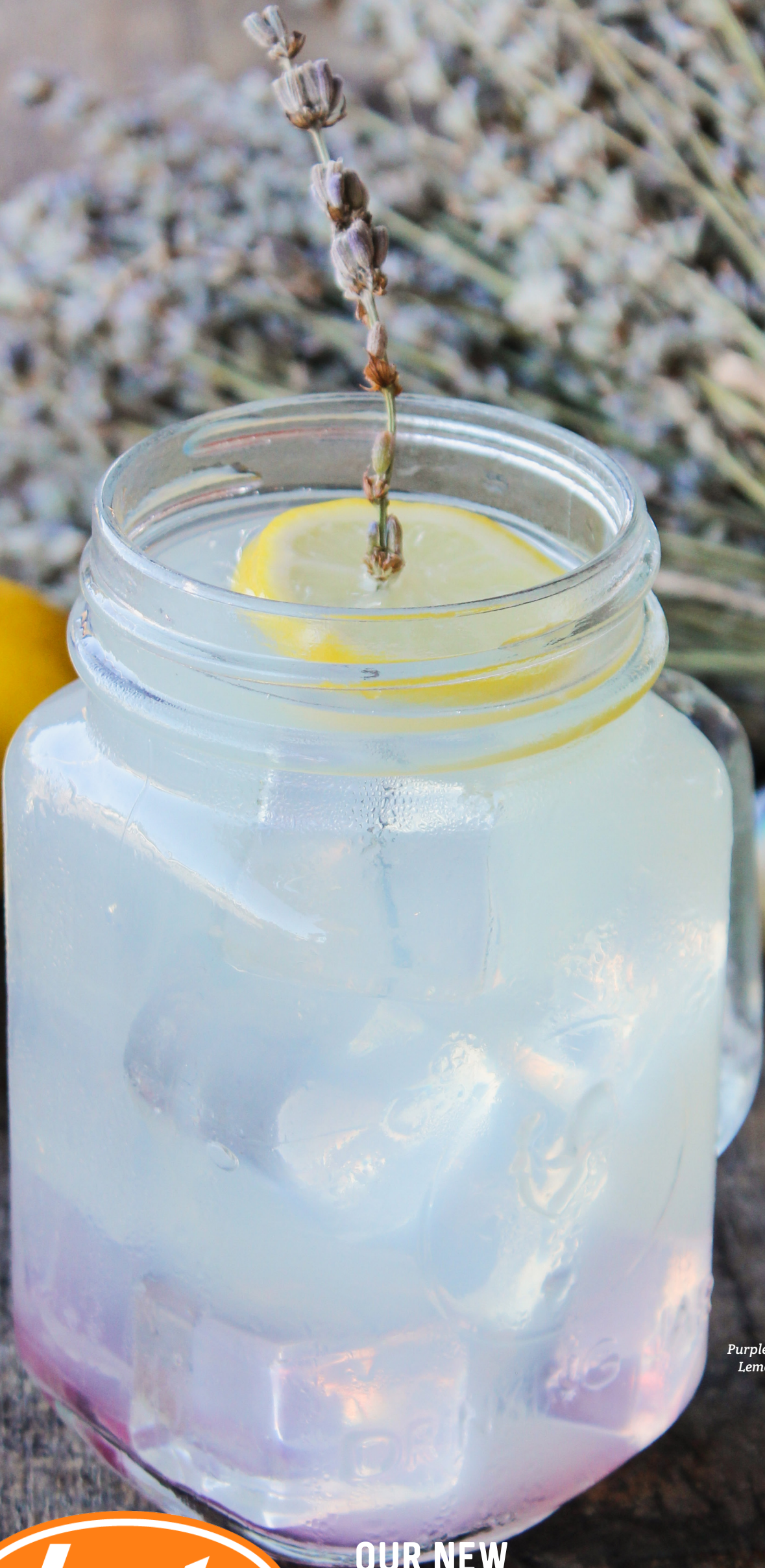
Purple Haze Lemonade