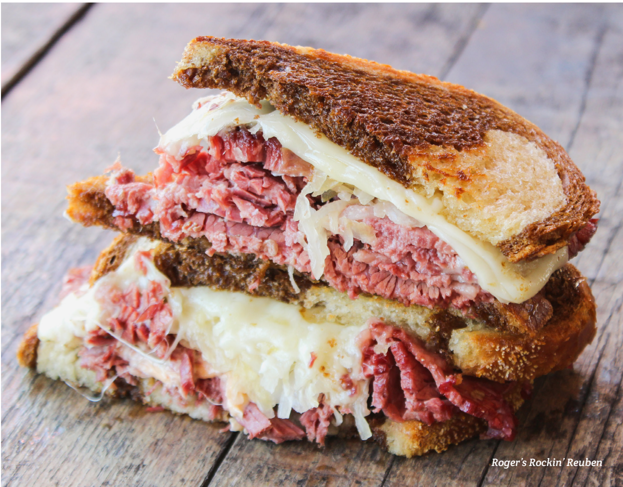
Roger's Rockin' Reuben

8:30AM - 3PM • SAT || 8:30AM - 9PM • SUN