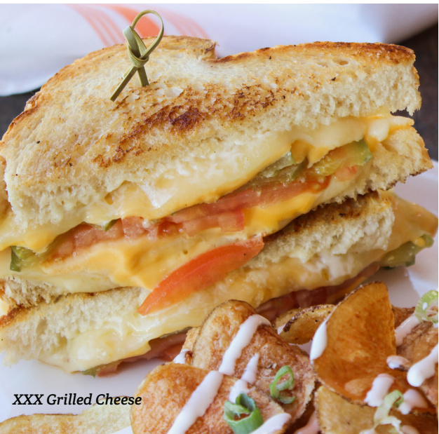
XXX Grilled Cheese

Buttermilk biscuits topped with creamy sausage gravy, bacon, tri-colored potatoes, green onions and two eggs* any way. 16