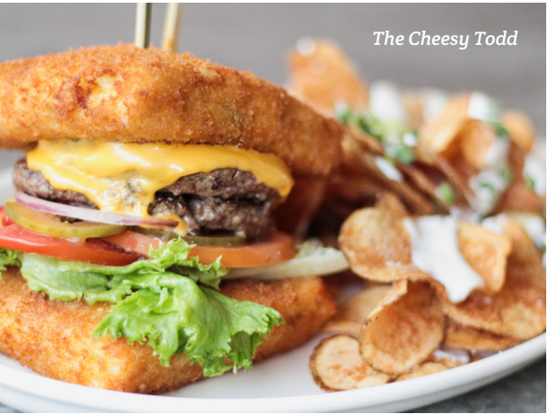
The Cheesy Todd