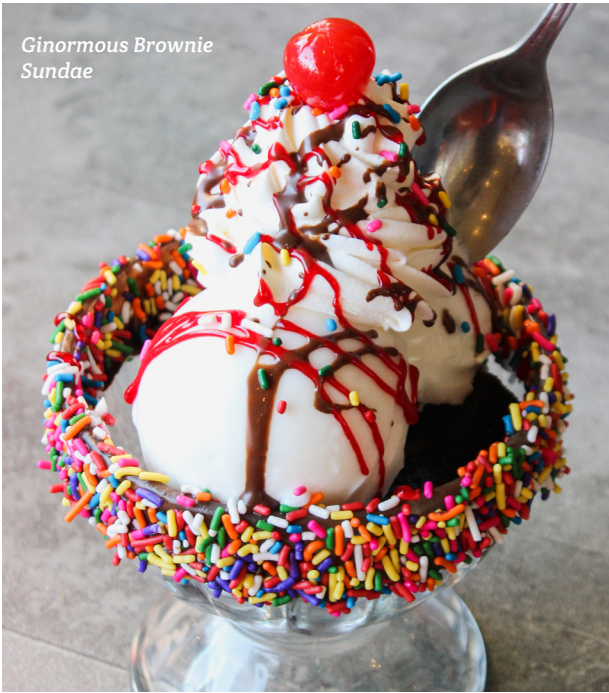
Ginormous Brownie Sundae

Fried chicken tenders tossed in spicy Nashville sauce, drizzled with honey, and topped with pickles, between a cinnamon sugar doughnut. 13