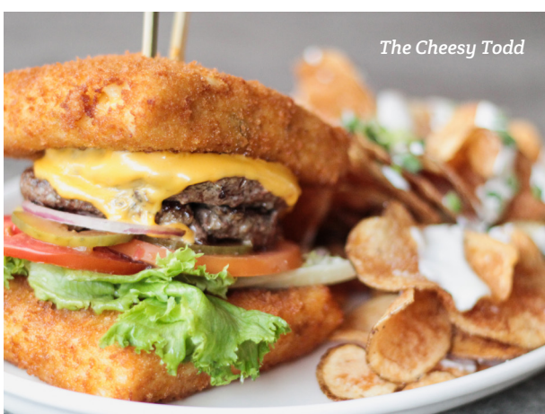
The Cheesy Todd