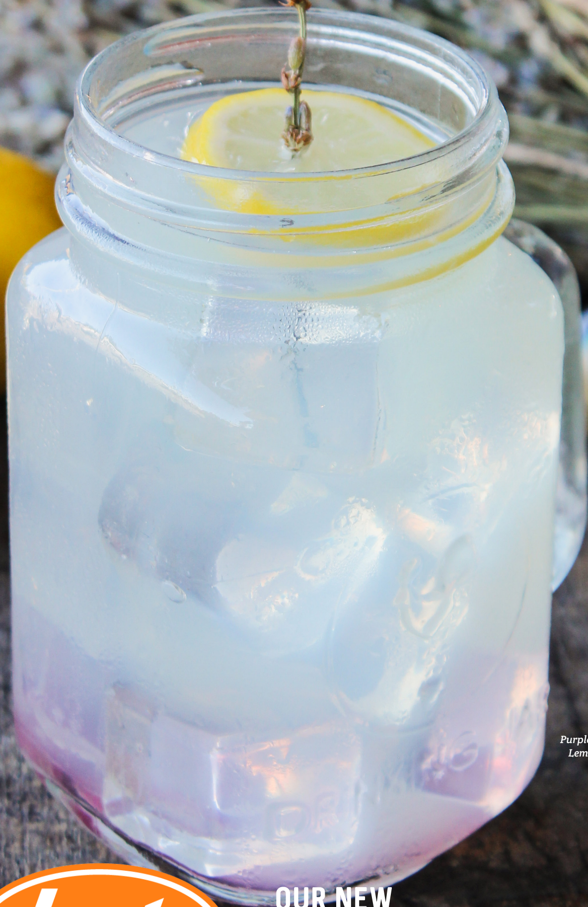
Purple Haze Lemonade