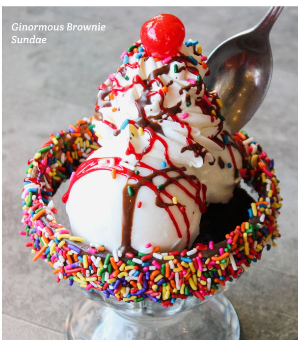
Ginormous Brownie Sundae

Rich chocolate brownie chunks, two scoops of vanilla ice cream, chocolate and strawberry sauce, whipped topping and a cherry. 12