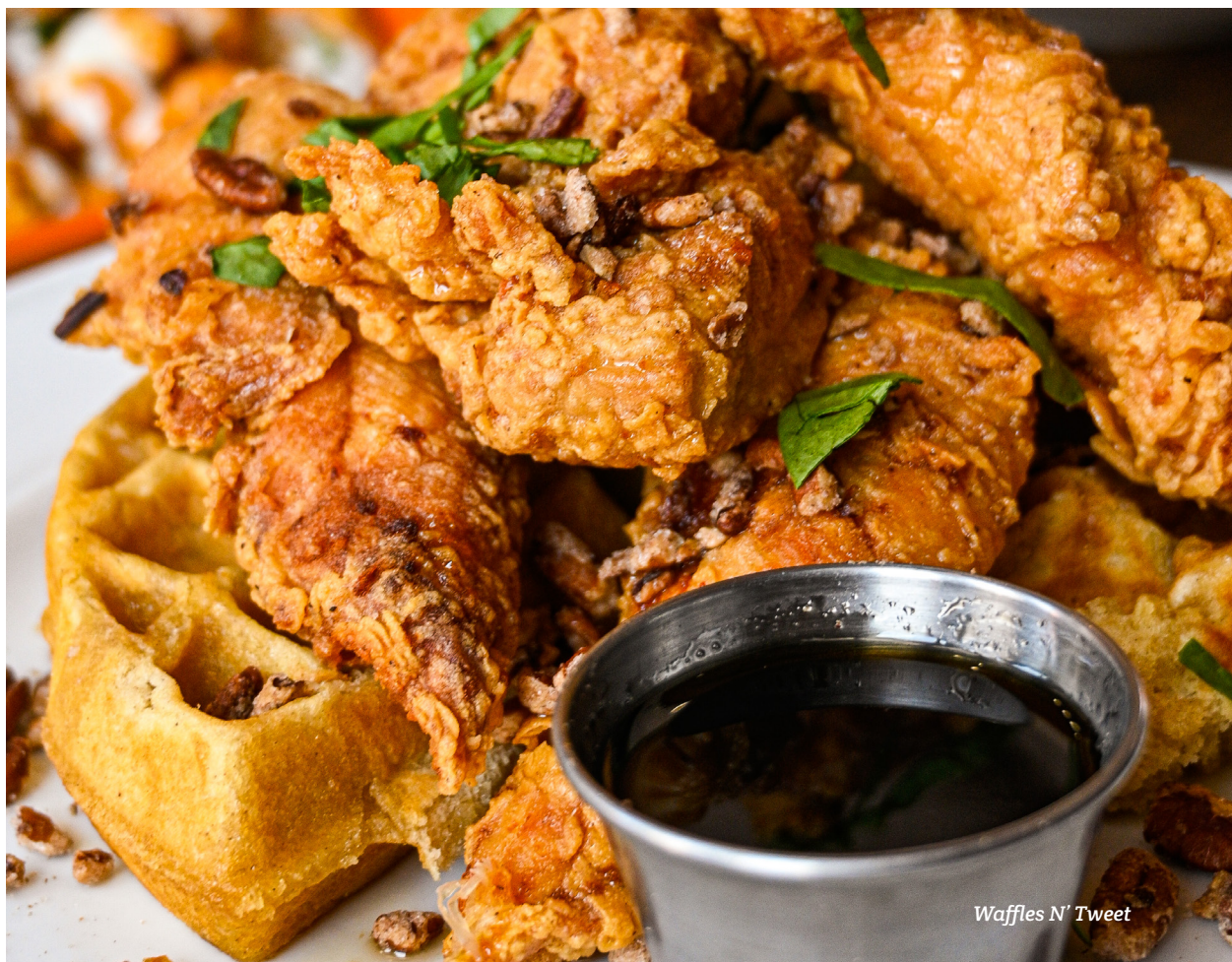
Waffles N' Tweet

11AM - 10PM • MON-THURS // 11AM - 11PM • FRI // 3PM - 11PM • SAT & SUN