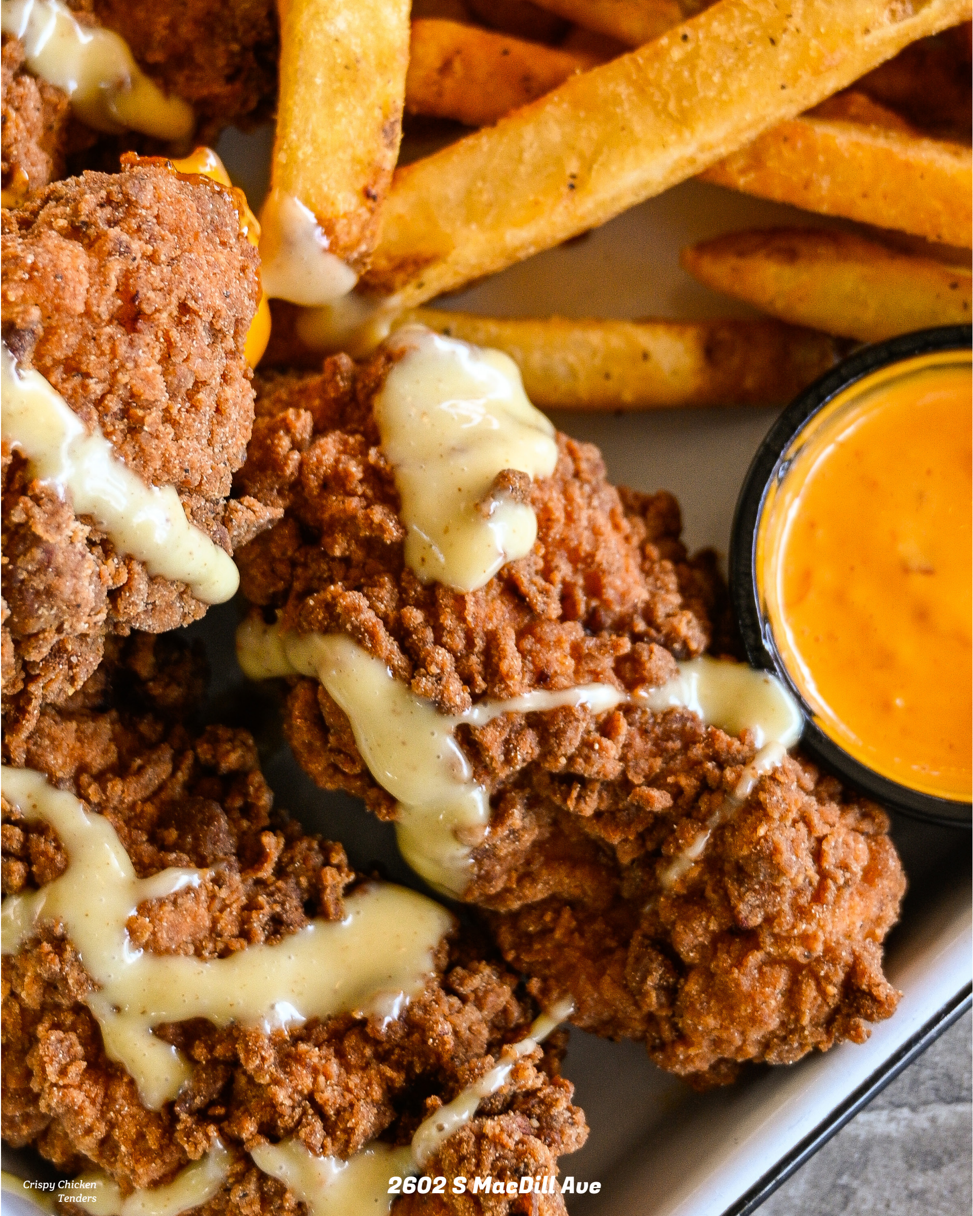
Crispy Chicken Tenders