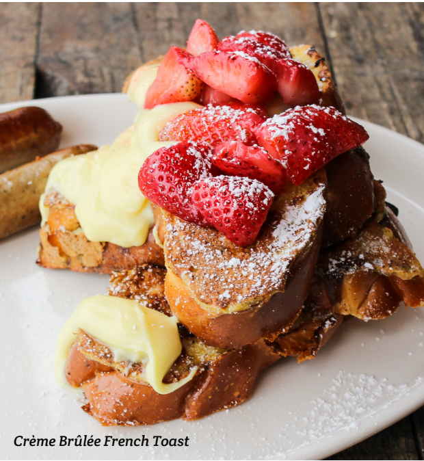
Crème Brûlée French Toast

CLASSIC BUTTERMILK PANCAKES A light, fluffy stack of buttermilk goodness with maple syrup and butter. 12