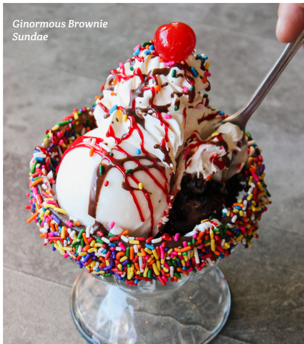
Ginormous Brownie Sundae

Fried chicken tenders tossed in spicy Nashville sauce, drizzled with honey, and topped with pickles, between a cinnamon sugar doughnut. 13