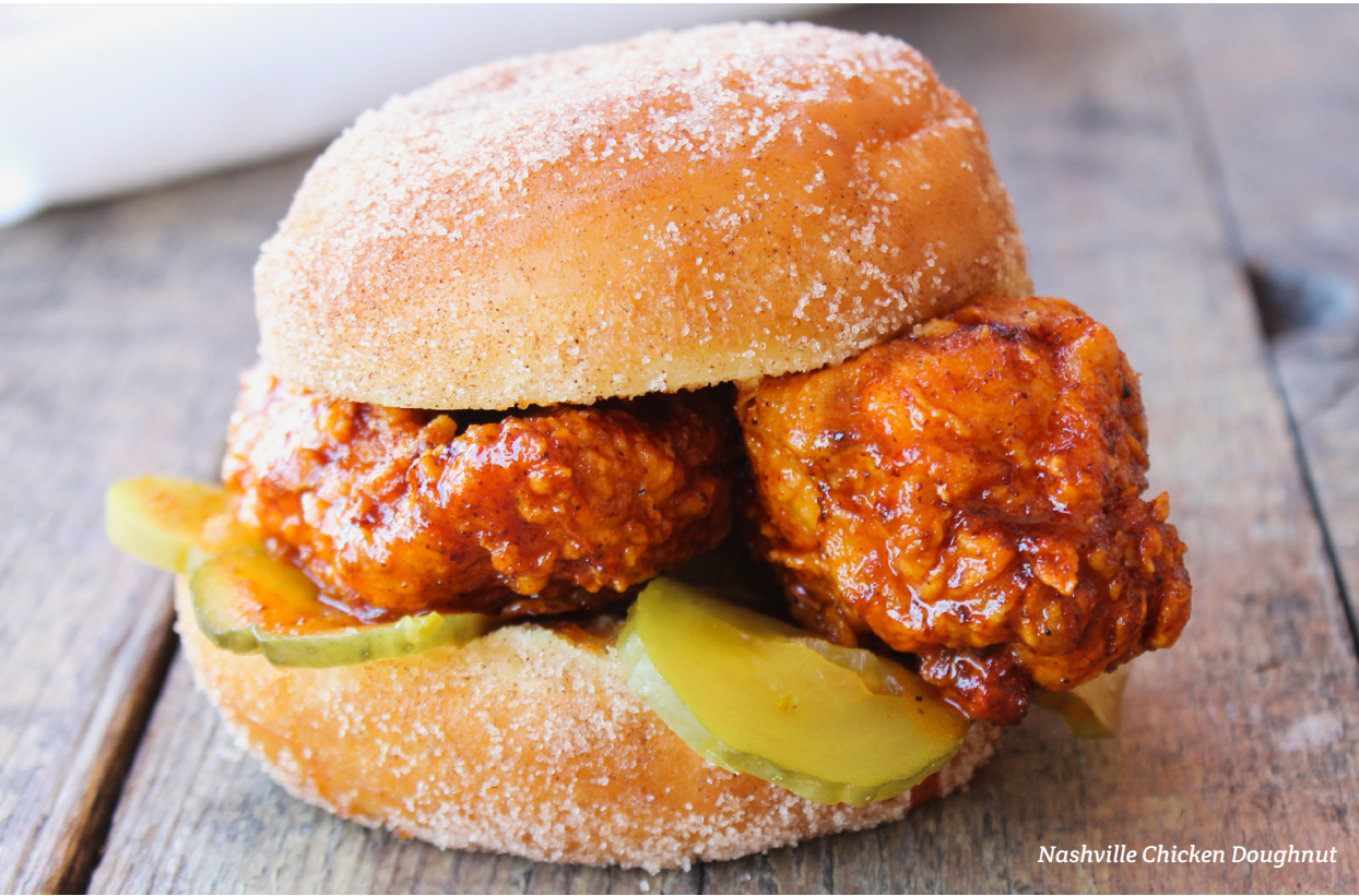
Nashville Chicken Doughnut

7AM - 11AM • WEEKDAYS (TAMPA LOCATION ONLY)