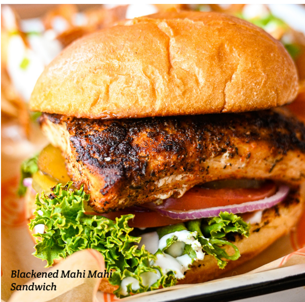
Blackened Mahi Mahi Sandwich

Buttermilk biscuits topped with creamy sausage gravy, bacon, tri-colored potatoes, green onions and two eggs* any way. 16